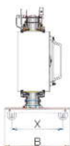
Version IP21, IP23, IP31